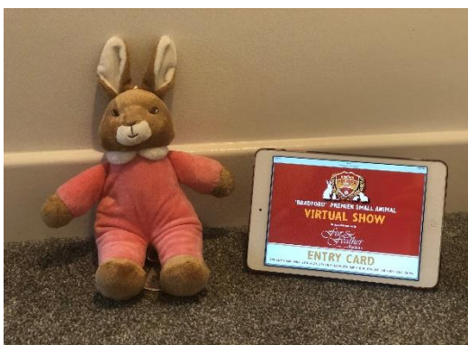
EXAMPLE FRONT ANGLE

Remember... The exhibit card must be displayed within each photograph. This is available on the official website to print, display on another device or included within Fur & Feather Magazine .